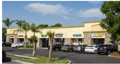
Two Retail Pads at Walgreens-Anchored Shopping Center in...