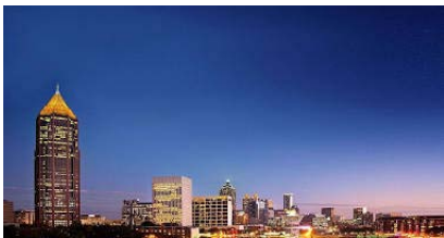
Spec Suite Surge, $10 Million Renovation Highlight Banner Year...