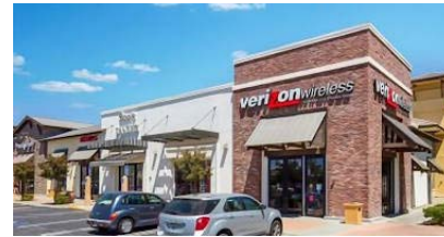
Retail | Real Estate News