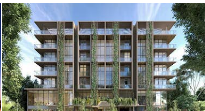
Trez Forman Capital Funds $20.66 Million Construction Loan for...