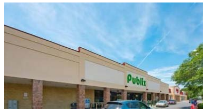
National Real Estate News Blau