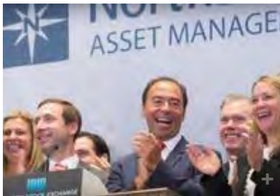
This Week's REIT Winners And Losers