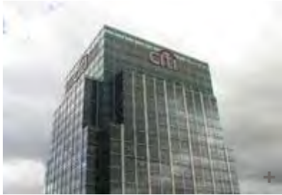
Banks: The Risk Of Global Recession Is Rising