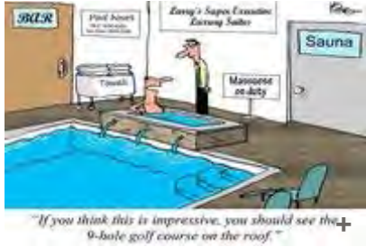
Bisnow 'Toon Time: Gotta Love Mixed-Use