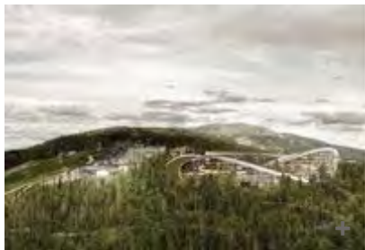
PHOTOS: Starchitect Draws Up A Ski Resort...On A Roof