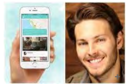
New Homesharing App Raises $2.5M In Seeding Round, Investor Speaks Exclusively