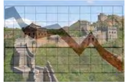
China's Stock Markets Dive—Just Before G-20 Summit